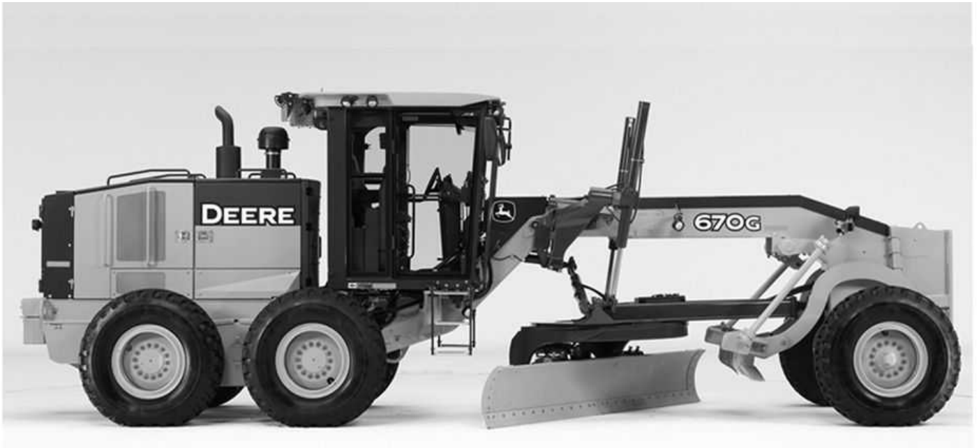
670G/670GP Motor Grader