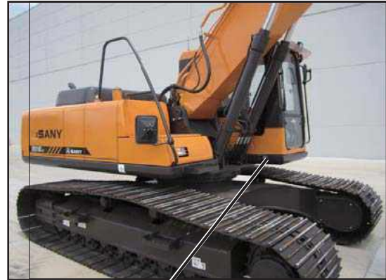
Fig. 1-5 a

The serial number (a) will be needed by your Sany dealer when ordering replacement parts or providing assistance for your machine. Record this information in this manual for future use.